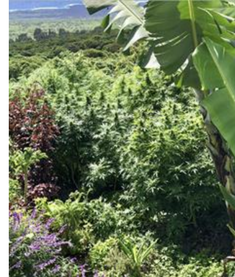
Biodiverse Polyculture Micro Farm Based in Hawai'i